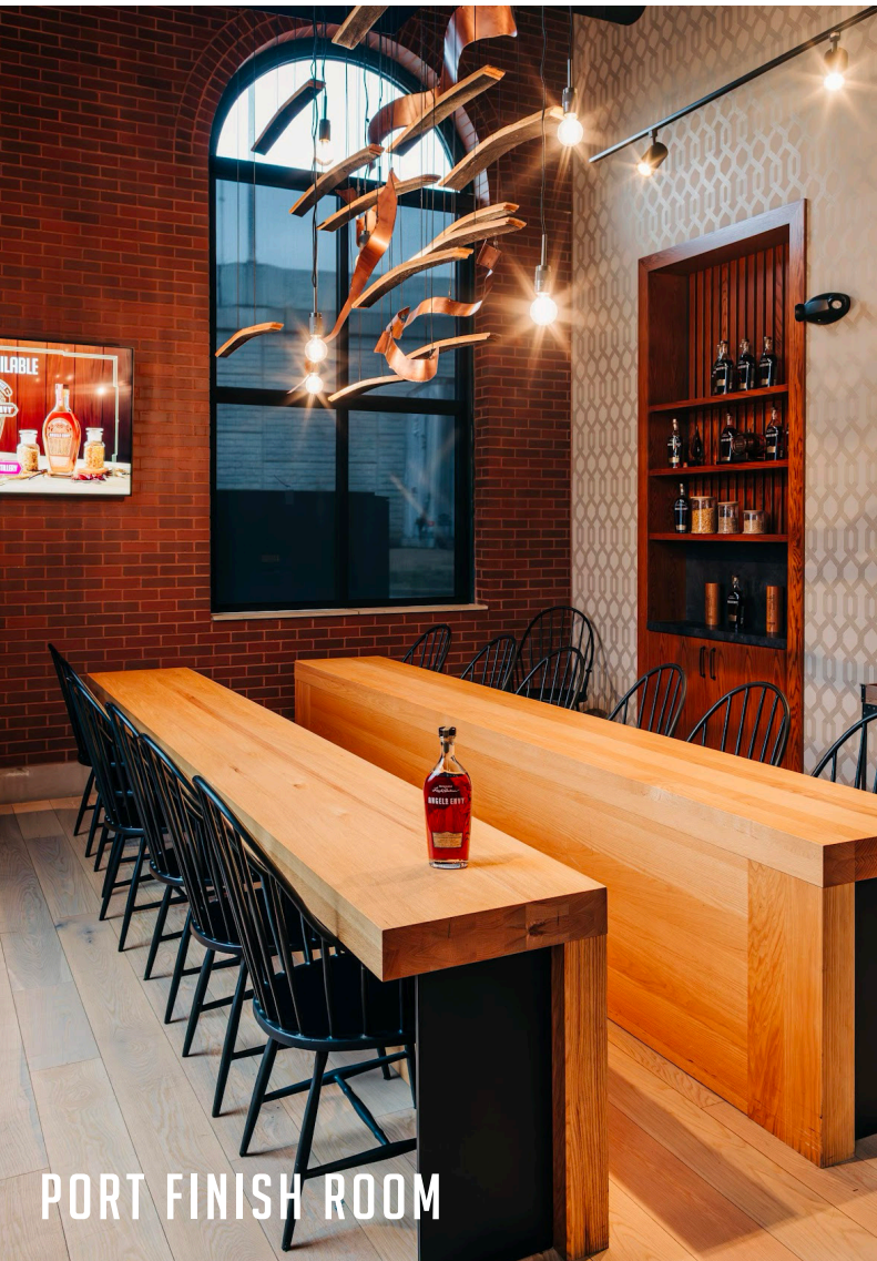
PORT FINISH ROOM