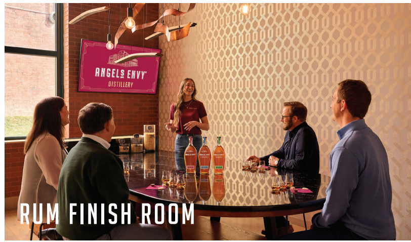
RUM FINISH ROOM