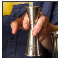
JAPANESE STYLE JIGGER $24

With 2 pieces of each of these 4 delectable selections, these chocolates are perfect for pairing with Angel's Envy® Rye Finished in Caribbean Rum Casks.