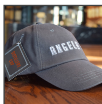
DISTILLERY CAP $30