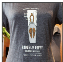
2019 ARTIST SERIES T-SHIRT $25

The perfect whiskey deserves the right glass. Our custom-made rocks glasses have just the right heft and are ideal for easy sipping.