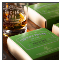
CHOCOLATE PAIRING, RYE (8 pc) $10

The Angel's Envy® Distillery Cap is made from medium-weight brushed 100% cotton twill and features an adjustable metal slide and tuck closure.