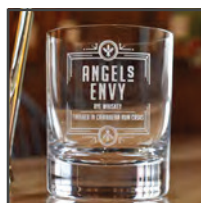
RYE ROCKS GLASS $18