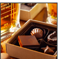
CHOCOLATE PAIRING, BOURBON (8 pc) $10

Share your good taste with the world by displaying our iconic, durable wing pin. Made from silver-plated nickel, these are the same wings illustrated on the back of every Angel's Envy bottle.