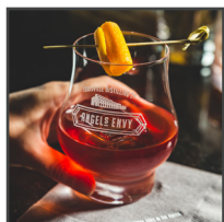
HENDERSON GLASS $22

A team favorite, these are the chocolates that we've selected to taste alongside Angel's Envy during our Finishing Room tastings.