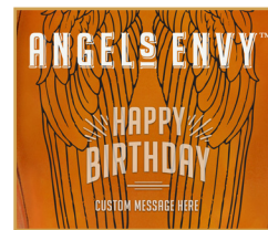
PERSONALIZED ENGRAVING $10 per bottle

3 line limit. Logos must be pre-approved.