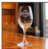
COPITA GLASS $20

This brushed stainless and stylish steel jigger features 1 oz over 2 oz pours with additional measurements marked within for your drink mixing convenience. It's a favorite among bartenders we know and trust.