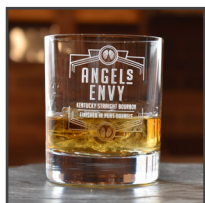
BOURBON ROCKS GLASS $20

Ideally suited for nosing and sipping, this 10 oz. Cask Taster style glass from Sterling perfectly complements The Henderson cocktail's rich flavors and aromas. It's one of our favorite ways to experience all things whiskey.